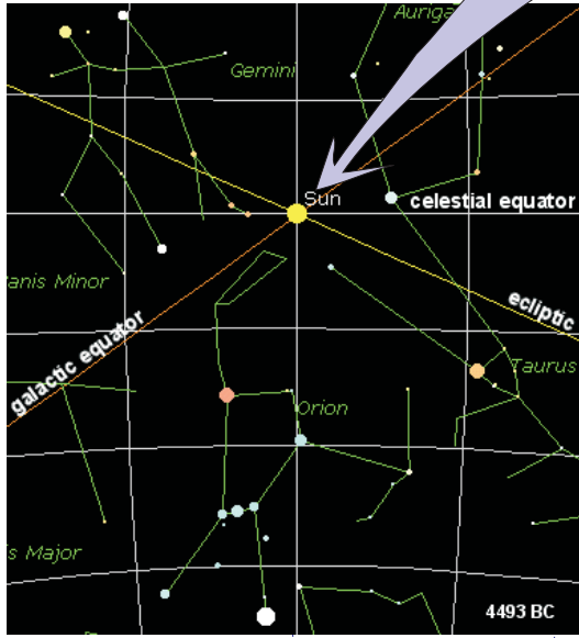
GRAPHIC FROM 'DUAT' BY VLADIMIR PAKHOMOV http://www.pakhomov.com/duat.html

T'SHAR DUAT IS IN THE ESSENTIAL CHAKRA POINT OVER ORION'S HEAD. "A KEYBOARD OF PASSAGE FROM WORLD SYSTEM 1 (THIS ONE) TO WORLD SYSTEM 2 (NEW EARTH STAR).