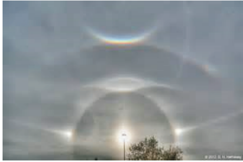
TYPICAL PARHELION: CAN BE SIMULATED BY A GROUP AS PART OF A LIGHT-PROCESS.

FACE OF MARKER, BORTHWICK CHURCH, IS THE PARHELION ALIGNMENT FOR THE ROSSLYN SYSTEM.