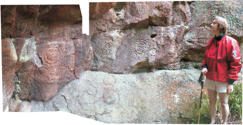
JACKIE QUEALLY OBSERVES THE SITE OF THE PARHELION FOCUS-APEX, AN ANCIENT CONTROL POINT FOR THE LARGE STELLAR SYSTEM THAT CAN CONSTANTLY STREAM INFORMATION INTO THE CHAPEL.

MAJOR GLEN SYSTEM: AMAGORAH IS THE CENTER OF THE HELIOTROPE, AT WALLACE'S CAVE, POOL