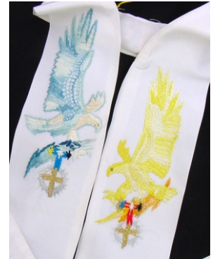
(EMBROIDERED BY Wm BUEHLER)